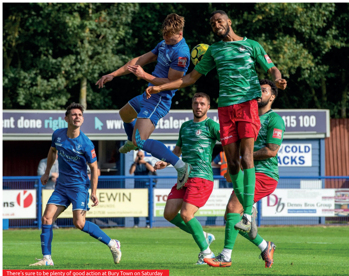
There's sure to be plenty of good action at Bury Town on Saturday

Having secured their first away win of the season in the previous round of this competition with a 3-2 success at Brightlingsea