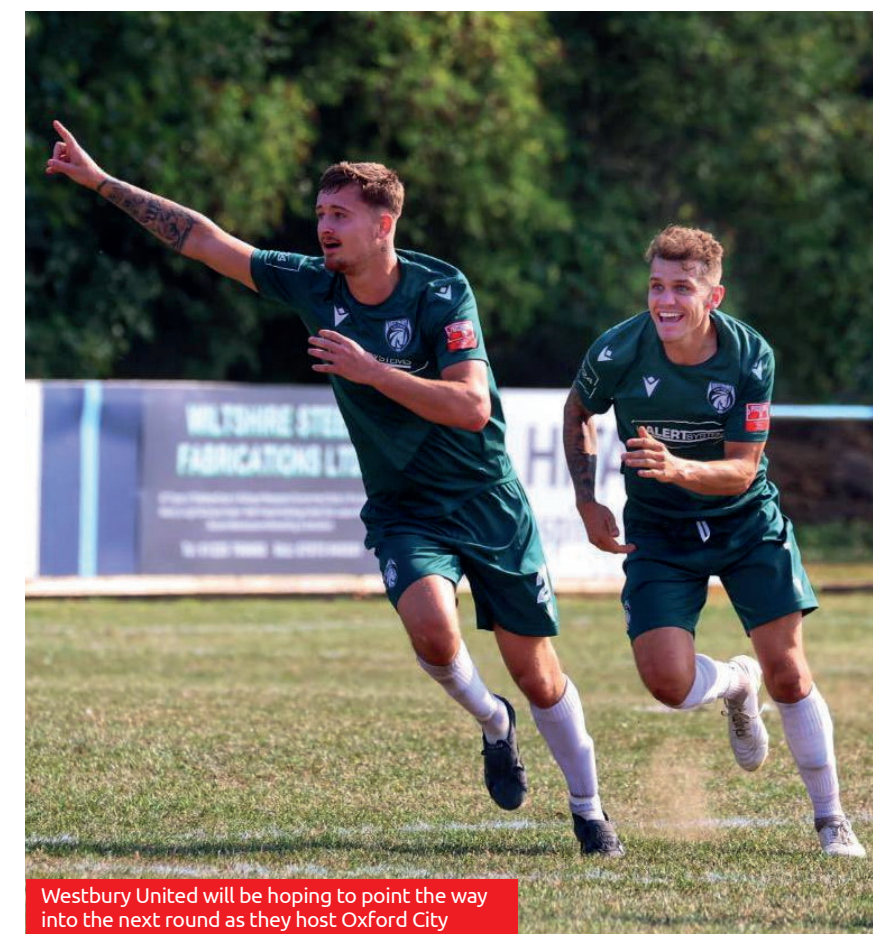
Westbury United will be hoping to point the way into the next round as they host Oxford City

Another side with an intriguing home tie is Westbury United, who welcome Oxford City of The National League North as they look to make some more FA Cup memories.