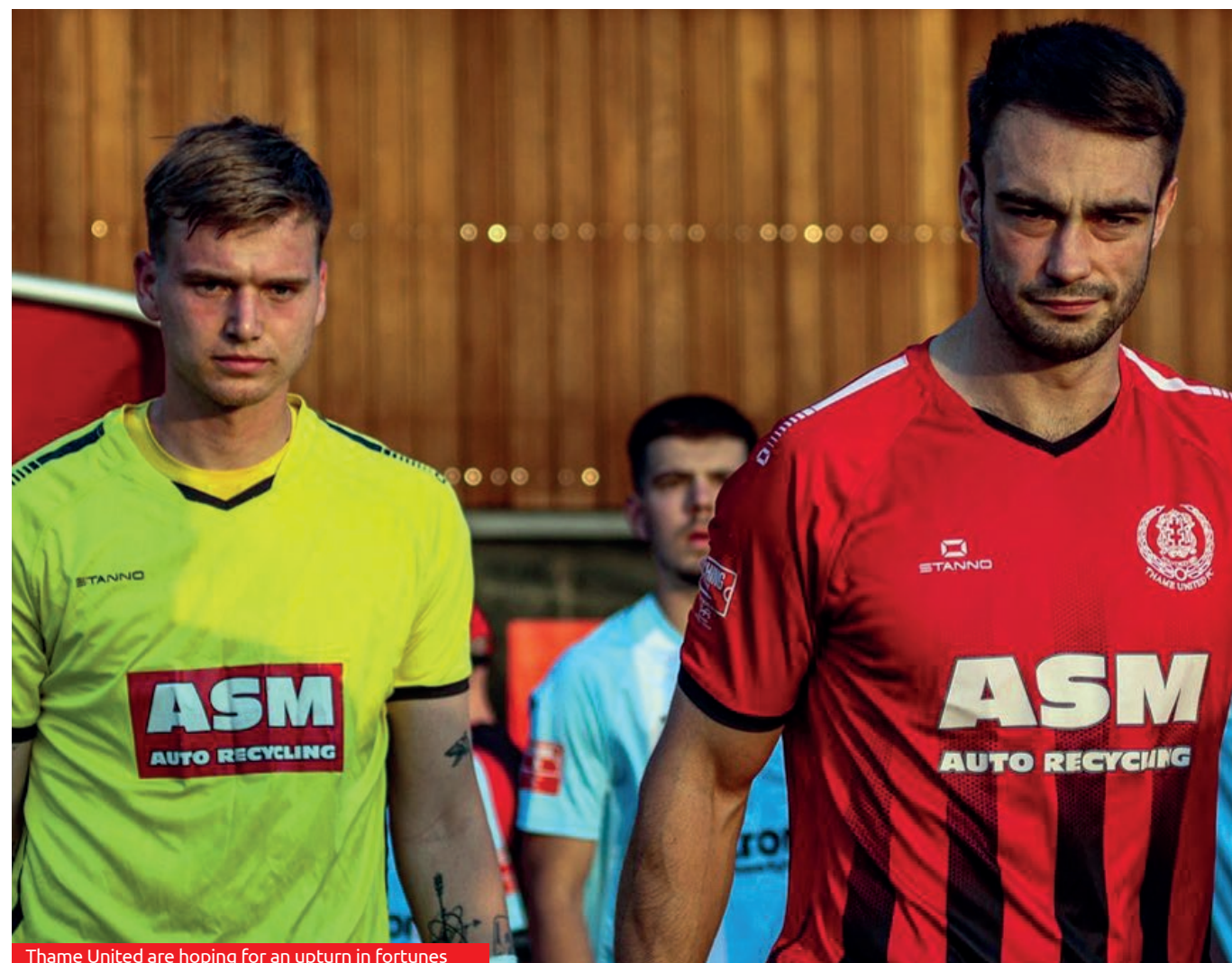
Thame United are hoping for an upturn in fortunes

"It was nice to finally have something to celebrate at the end