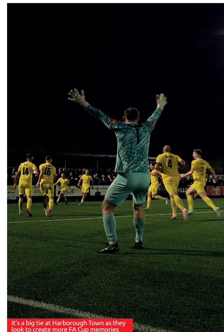
It's a big tie at Harborough Town as they look to create more FA Cup memories

It's an away tie for Stourbridge as they go to Sutton Coldfield Town hoping that this will be the season in which they can create some more memories in this special competition.