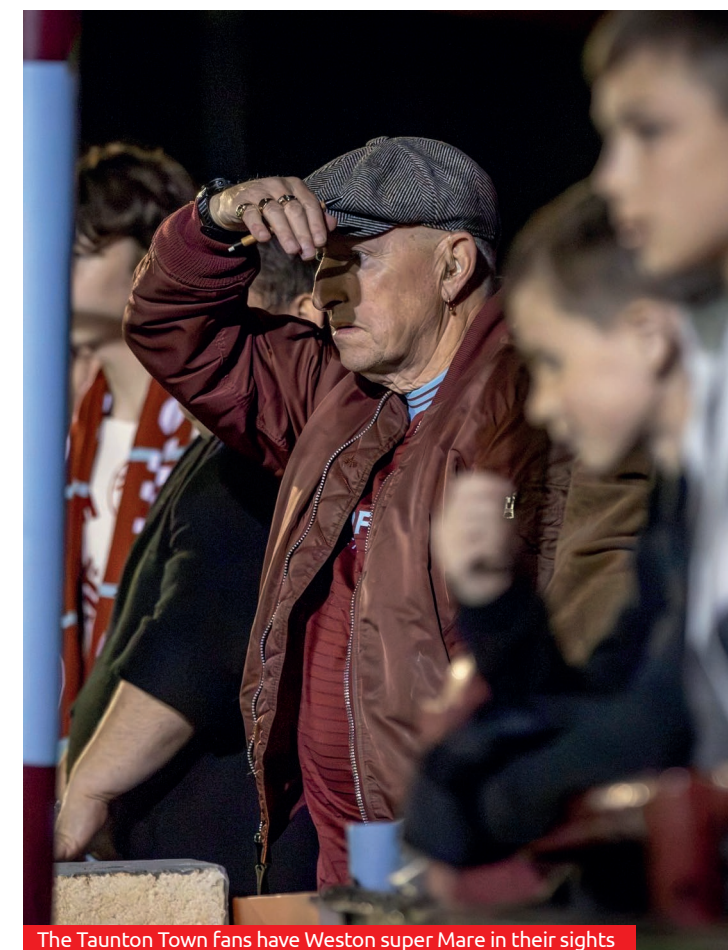
The Taunton Town fans have Weston super Mare in their sights

Two Premier South clubs battle it out as Gosport Borough host Poole Town, whilst Hanwell Town welcomes Bedfont Sports. There's a mouth-watering tie for Taunton Town against Weston super Mare as Walton & Hersham head to Whitehawk and Wimborne Town also entertain higher-level opposition in Bath City. It's a short trip for Evesham United as they go to Racing Club Warwick.