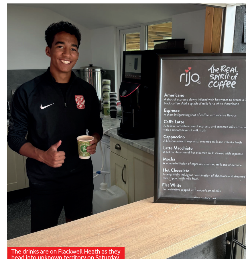
The drinks are on Flackwell Heath as they head into unknown territory on Saturday

A home clash for Hitchin Town sees them play host to St. Albans City, whilst it is a step into the unknown for Flackwell Heath as they head to the lowest-ranked team left in the competition, Soul Tower Hamlets.